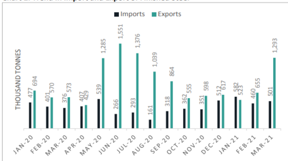
Chart 2: Trend in Import and Export of Finished Steel

Higher steel prices, increasing demand and higher margins has supported rise in steel raw material prices. In April 2021 prices of iron ore has increased 112% yoy, prices of ferrous scrap increased 67% yoy and Met coke increased 44% yoy.